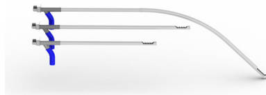
Augers for connecting with Mafa bins or Flexi-Bulk silo.