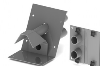
Suction nozzle (left) and Suction connection (right) for manually switching between two nozzles.