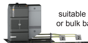
suitable for bin, fabric silo, or bulk bag storage. can be bag-fed.

Shipping: All products F.O.B. Nashua, NH. Shipping costs are extra.