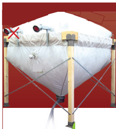
3.6 ton capacity Flexi-Bulk silo with posts and beams (not included). Specify auger or vacuum for transport from silo to boiler. Optional single fill connection at bin requires bringing fill hose to bin (as shown). Fill connection can also be made to home exterior.